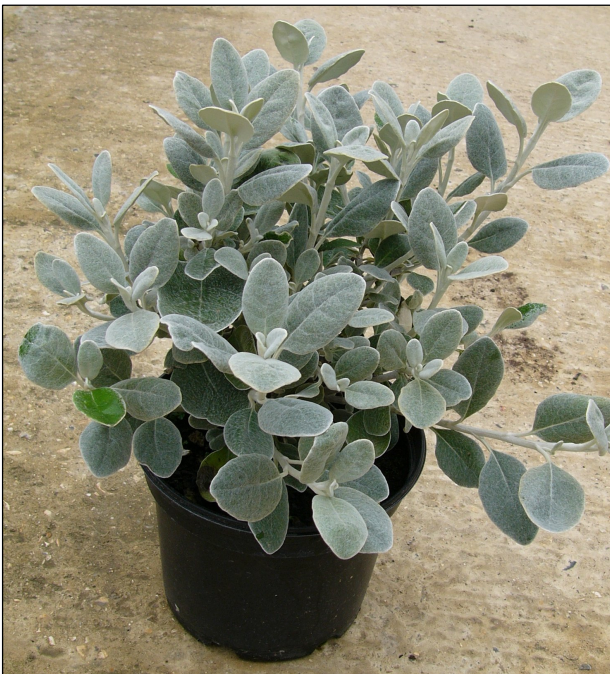
Left: Brachyglottis Walberton's® Silver Dormouse in a 3 litre container. Note that this variety does not produce bare stems with dead leaves at the base, which can be a problem with Brachyglottis Sunshine.