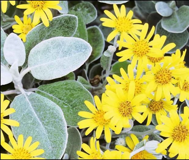
Above: Brachyglottis Walberton's® Silver Dormouse in flower.